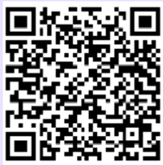
Barcode of 56:1 OC, Pune