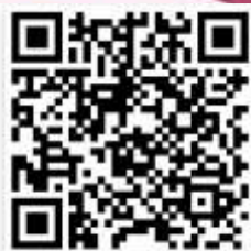
Photographs of 56th IOC Pune

At the 56th IOC Pune The Scientific sessions were a blend of exemplary and didactic lectures.